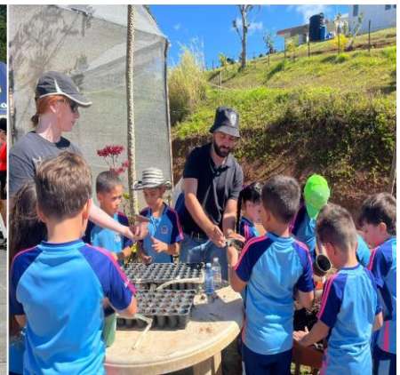
Students engaged in hands-on agricultural learning

“We are not just installing a roof; we are creating a lasting sanctuary of hope and joy for the future leaders of Puerto Rico.”