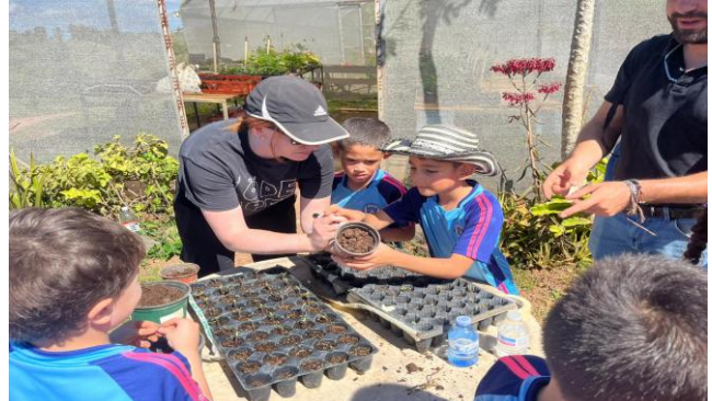
Every seed planted is a lesson in stewardship and hope