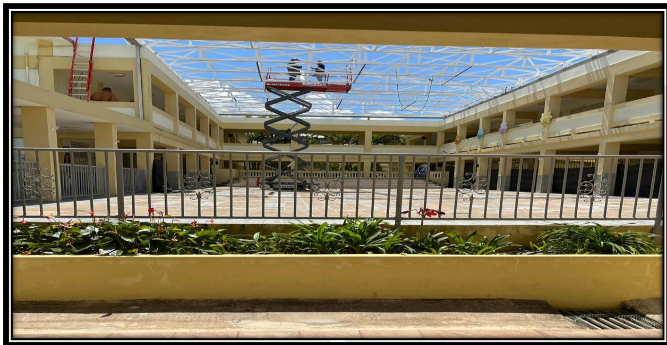
An elegant grid of white steel reaching skyward