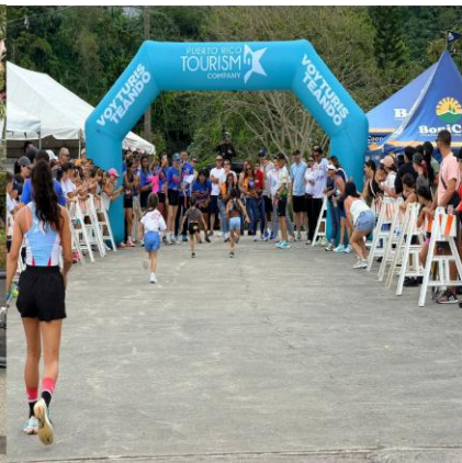
Families, runners, and community united for ALESPI