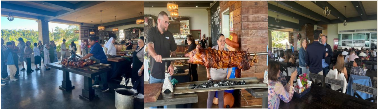
Latidos de Esperanza—December 6, 2025 · Toro Verde, Orocovis