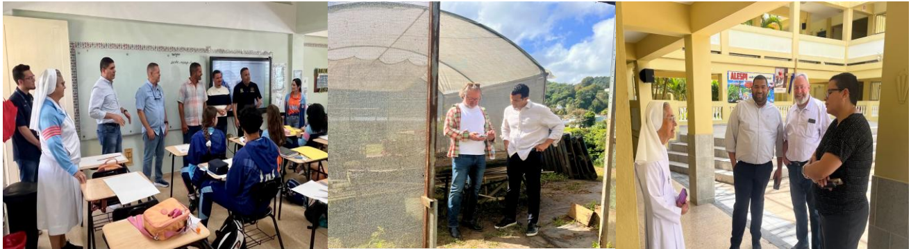
Government, private, and corporate partners touring the facility and committing support

"My path in ALESPI began as a student. Today I have the honor of serving as Principal in the very same home where I grew up. I am living testimony of how ALESPI transforms its students into committed citizens capable of leading with the heart."