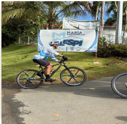
ALESPI 5K & Bicicletada · April 12, 2026